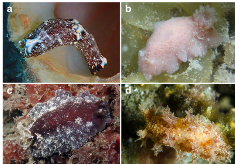
Fig. 2 a. Philinopsis orientalis . Fly Point, 14 February, 2015. b. Jorunna ramicola . Pipeline, 30 November, 2013. c. Thordisa tahala . Little Beach, 15 January, 2015. d. Marionia pustulosa . Seahorse Gardens, 7 March, 2015.

protection from the effects of strong southerly winds and large ocean swells. The tidal range in the sheltered port is approximately 1.4 m (Creese & Wales, 2009) and the average depth is 14 m (Poulos et al., 2015).