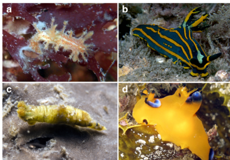
Fig. 4 a. Kaloplocamus peludo. Fly Point, 11 September, 2014. b. Tambja victoriae. Fly Point, 20 February, 2010. c. Polycera risbeci. Pipeline, 23 November, 2014. d. Thecacera pacifica. Fly Point, 6 December, 2014.