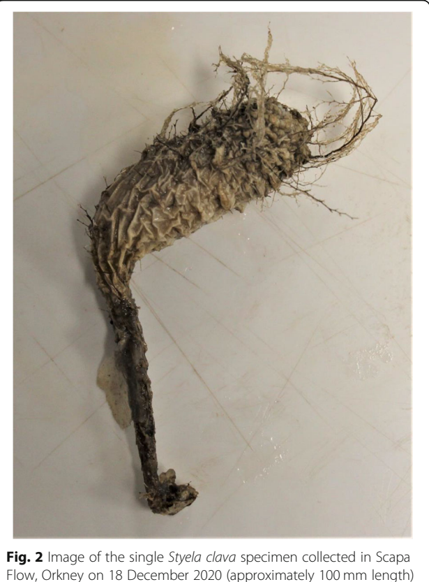
Fig. 2 Image of the single Styela clava specimen collected in Scapa

Primary introduction into UK waters is believed to have occurred on the hulls of naval vessels returning from the Korean War (Eno et al. 1997). Once established, artificial structures facilitate S. clava spread to new areas by acting as 'stepping-stones', and reintroduction is possible via hull fouling and ballast water (Eno et al. 1997; Lützen 1998; Clarke and Therriault 2007; Davis and Davis 2008; Darbyson et al. 2009). The presence of S. clava in harbours and marinas in close proximity to oyster farming, and its absence from locations without shellfish aquaculture, suggests that the spread of S. clava may be linked to the transfer of oysters between facilities (Davis and Davis 2008; Darbyson et al. 2009). There are currently two oyster farms and one hatchery operating in Orkney waters. A variety of vessels could provide a substrate for transmission, including small recreational craft (Minchin et al. 2006; Darbyson et al. 2009). At ports with established populations of S. clava, larvae may settle and grow on vessel hulls. While hydrodynamic forces experienced during vessel travel may prevent survival on the external hull, the presence of socalled 'niche' areas including sea-chests, thruster tubes, and other cavities, may provide places for fouling species to persist (Coutts and Taylor 2004; Davis and Davis 2008). Transfer of S. clava through ballast water is deemed unlikely owing to the short larval period of this species (Clarke and Therriault 2007).