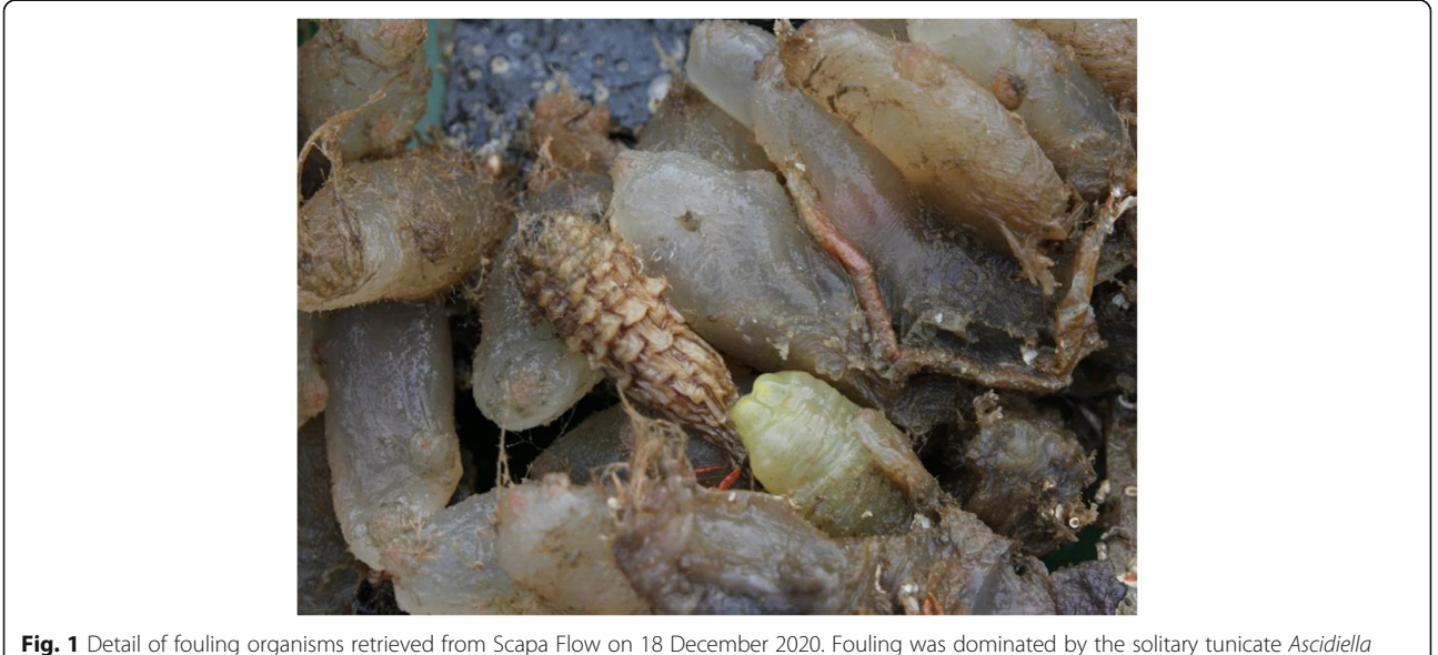
Fig. I betail of fouling organisms retrieved from Scapa Flow on 18 December 2020. Fouling was dominated by the solitary funcate Ascialella aspersa but included a single individual of the leathery sea squirt Styela clava . This image also features an individual Ciona intestinalis sea squirt

The invasive non-indigenous leathery sea squirt S. clava has been rapidly expanding its range in UK waters since being first recorded in the early 1950s. This new report from Scapa Flow in Orkney of a single adult specimen constitutes a 1.54° latitudinal extension from the previously recognised most northerly record, from Loch