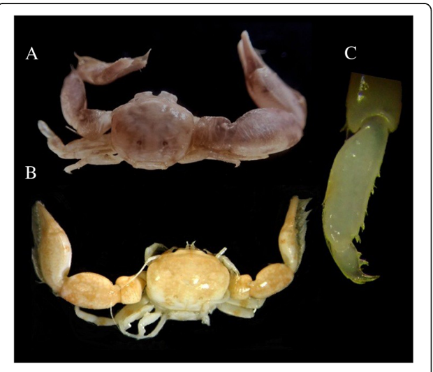
Fig. 1 Polyonyx loimicola Sankolli, 1965 from Suez Gulf, Red Sea, Egypt. a, b entire animal, dorsal view ( a live coloration; b preserved coloration); c propodus and dactylus of third pereopod (second ambulatory leg), lateral view. a RCAZUE.Crus. 36,402, male, Cl 4.9 mm; b, c RCAZUE.Crus. 36,401, female, CL 4.7 mm

Third maxilliped (Fig. 2c) ischium smooth, length about as long as maximum width; merus with well demarcated rounded lobe on ventrolateral (flexor) margin;