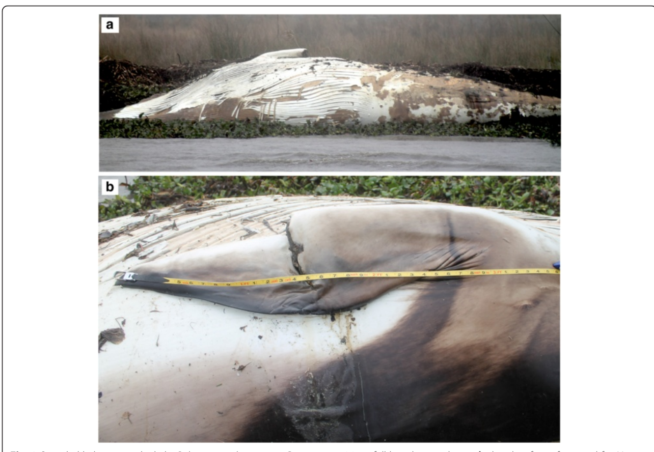
Fig. 2 Stranded balaenopterid whale, Balaenoptera bonaerensis Burmeister, 1867, a full length ventral view, b dorsal surface of pectoral fin. Note lack of distinct bright white flipper patch

resulting in final alignments of 430 bp, 294 bp, 508 bp, and 663 bp for AMBN exon 13, CAT, INT and LALBA, respectively. We identified a total of 58 variable sites and four 1 bp indels and one 21 bp indel within the truncated, aligned 1895 bp of nuclear data when comparing the three balaenopterid species (Fig. 4). For CAT, the unknown baleen whale sequence was identical to seven GenBank entries for known B. bonaerensis samples from Jackson et al. (Jackson et al 2009) and no fixed differences or indels were present in comparison to the other available Antarctic minke whale sequences (Fig. 4). On the other hand, there were three fixed differences and a single base pair indel between the unknown whale and the 13 B. acutorostrata samples at this locus. This animal exhibited from 0 (INT) to 12 (AMBN exon 13) fixed differences from common minke whales and a 21 bp deletion in INT further distinguishing it from common minke whales and Gulf of Mexico Bryde's whales. Overall, in comparison to the common minke whale and the Gulf of Mexico Bryde's whale, the unknown stranded whale exhibited a total of 16 and 19 fixed differences, respectively, across the four loci (Fig. 4).